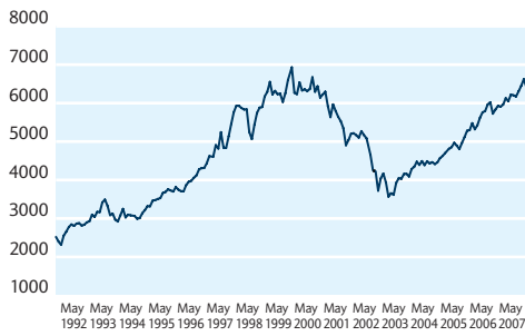
FTSE® 100 Index (capital return only)

You should be aware that an investment linked to the stock market is different from depositing money in a building society or bank account and access to your capital during the investment term is restricted.